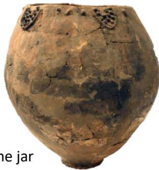
Ancient Georgian wine jar

Discover the cradle of winemaking – the Armenian Highlands, between the majestic Caucasus Mountains and Biblical Mt. Ararat, where Noah planted grapes ( Genesis 9:20 ). The ancient people of the Shulaveri – Shomu Culture (6,000 – 4,000 BC ) pioneered wonderful wines that can be savoured in present-day Armenia and Georgia!