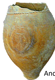
Ancient Armenian karas amphora